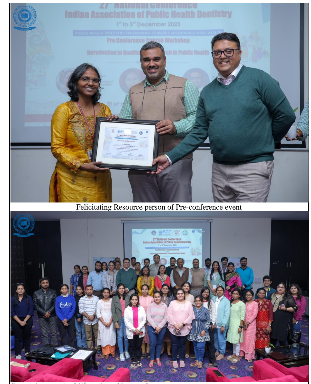
Group photograph of 3<sup>rd</sup> session of Pre-conference event