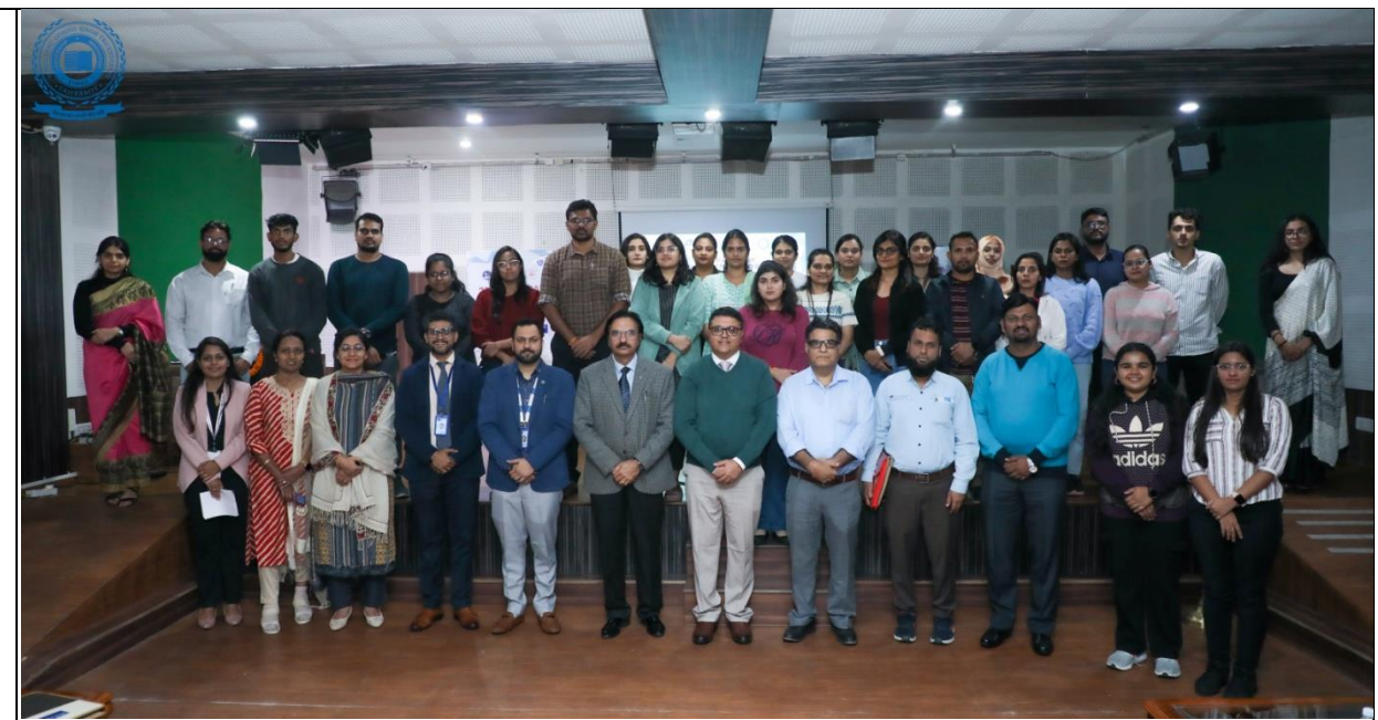
Group Photograph of 2<sup>nd</sup> session of Pre-conference event