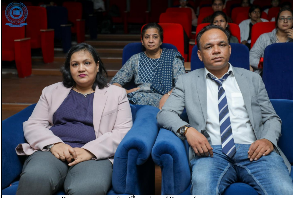
Resource persons for 4<sup>th</sup> session of Pre-conference event