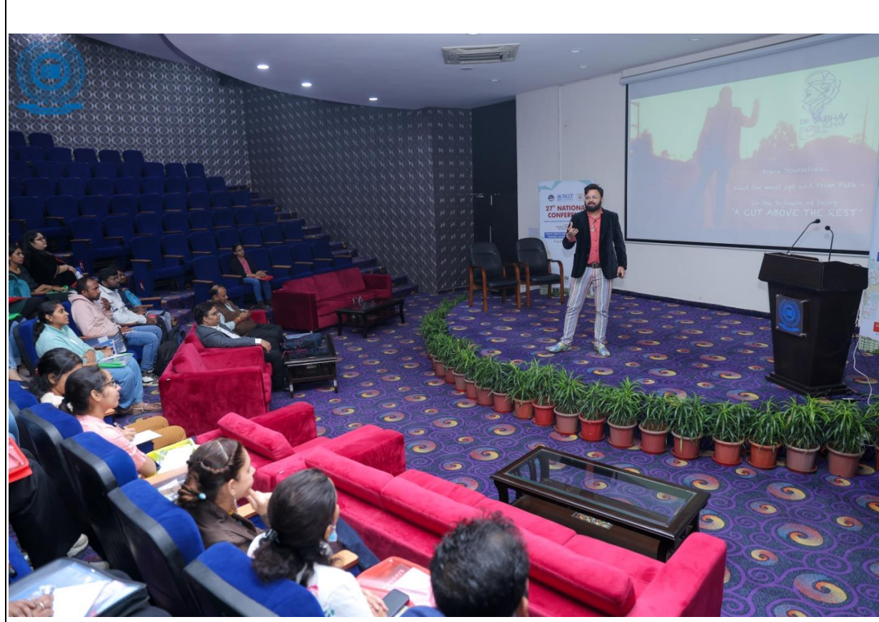
First Session of pre-conference event